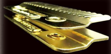
Vintage End Plate 0,5 mm Back Beat End Plate 1,0 mm

Standard Back Beat Wires are 20 Strand Also available in 16 & 42 Strand